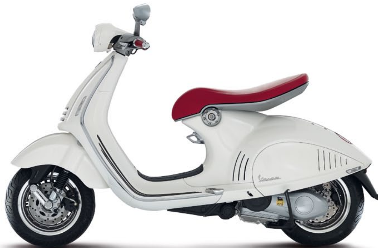
W H I T E