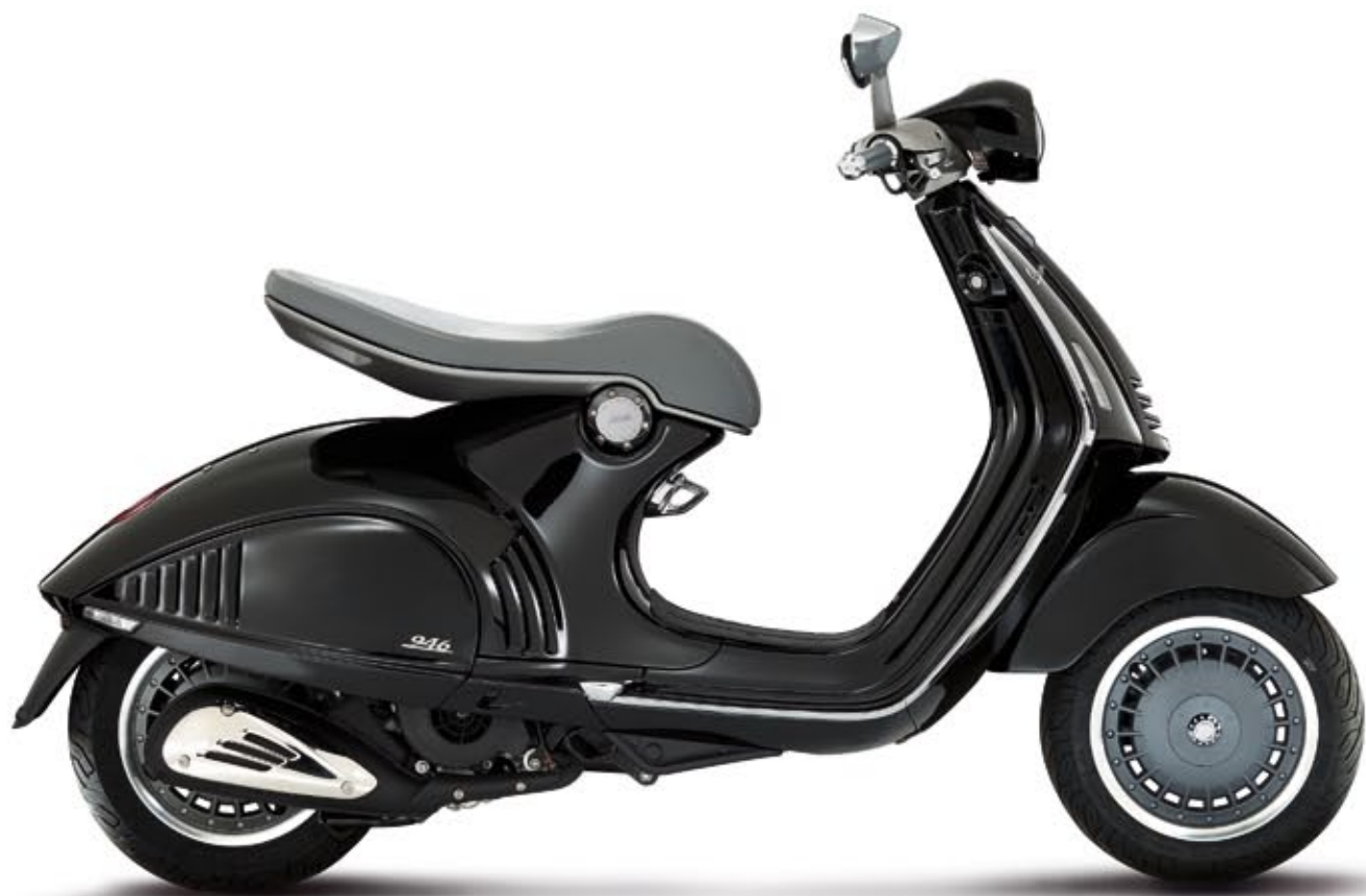
B L A C K